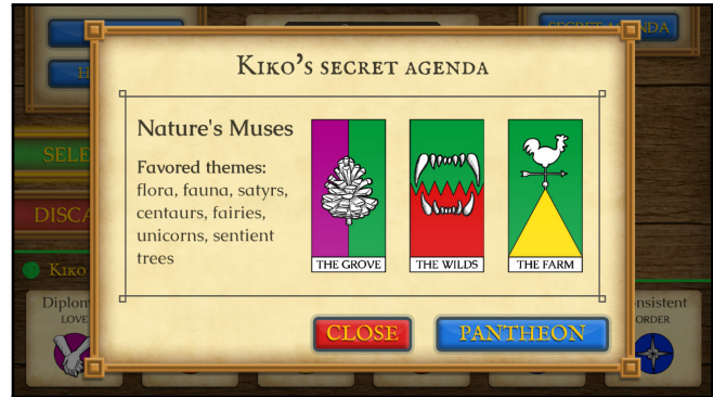
(b) Each player has a secret agenda with three deities.