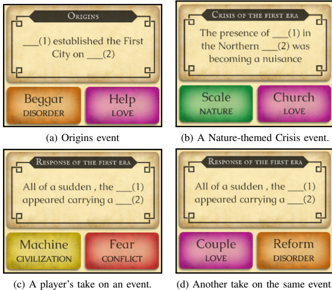
Fig. 3: Events and words can be combined in novel ways.

Ones in Lovecraftian horror (this is accentuated by the use of “church” as the second word). In Fig. 3d the word “reform” (normally presumed a verb) is used as a noun for a change in policies. Even more interesting semantic leaps are possible: the Nature word “scale” in Fig. 3b could be used to refer to the scales of justice (intuitively connected to Order) or a merchant’s scales (intuitively connected to Civilization).