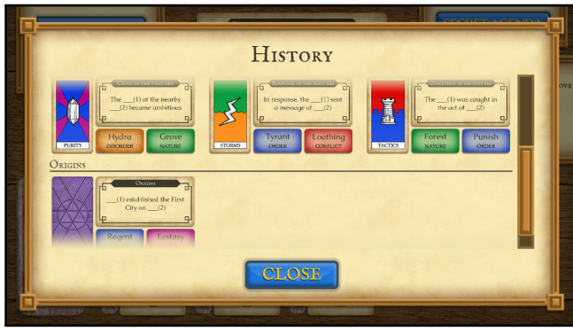
Fig. 7: An ongoing game, its winning stories and ascendant deities are stored in the history screen (accessible at any time).

victory conditions and as ways for players to get inspired or renew their hand. On the other hand, the requirement for story continuity across multiple Eras and the winning condition of three ascendant deities in a player's secret agenda results in long playthroughs. The game is designed to end after three Eras (i.e. 10 events), which can lead to playthroughs lasting well above one hour. Understandably, the game's duration increases with more players, which has led to the upper limit of five players. The game can be stopped and resumed through a save/load function, somewhat mitigating the issue. The history screen (see Fig. 7) allows players to review past events, which is especially important when resuming an older saved game. However, since a big part of the game is in the verbally narrated player stories, there is a risk of forgetting aspects of the history or losing the thread of the narrative.