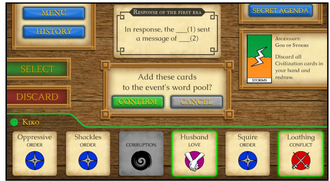
(a) Word Selection

The Newborn World urges players to recite the story of the First City, its origins and tribulations. This imaginary city is the first attempt of men and women to form a society, guided by primordial deities. The players will be contributing to the history of the First City by choosing the best story for each event. Each event has two gaps (numbered) which players must flesh out with word cards. The winning story for the event is remembered (as part of the city’s history) and next events must continue the accepted storyline. The game always starts from the same Origins event, which contextualizes the First City. After that, the game is played in Eras composed of 3 events: the Crisis, Response, and Conclusion. Each event type has several different templates to choose from, increasing variety. Crisis events also depend on which story elements