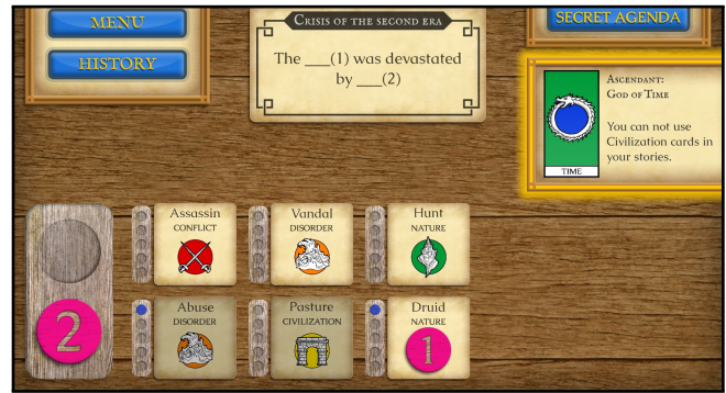
Fig. 4: For players after the first one, the options for word combinations are fewer due to other players’ chosen words (shown as small circles next to word cards). In this case, the ascendant deity also forbids the use of Civilization word cards.

The Newborn World gives players a hand of possible word cards (normally six) which are likely to feature three or more story elements overall. More importantly, players need not use only words in their hand to construct stories. Instead, each player contributes to a word pool which becomes available during the storytelling phase to all players. Thus, players may contribute a word they find particularly appropriate to the story and anticipate another player’s contribution. Assuming no special rules imposed by an ascendant deity (discussed below), players’ stories can share word cards as long as they do not share both cards with the same player. This can mitigate the challenge of finding appropriate words within the player’s own hand, but also removes some player control over the stories