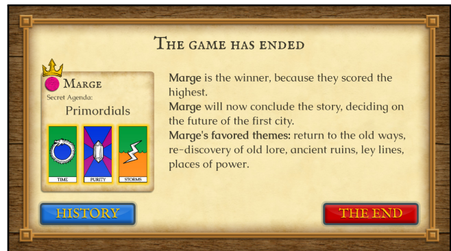
(c) The winning player concludes the story based on their agenda's themes.