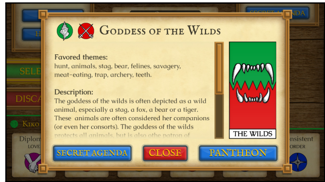
(a) Description of the Goddess of the Wilds.

Ascendant deities can influence the next round, forcing players to discard word cards or forbidding the use of certain story elements during the storytelling phase. An ascendant apex also asks players to decide collaboratively (without cards) on how