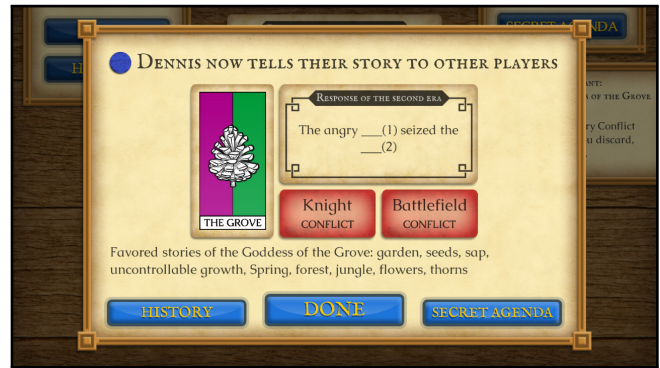
Fig. 6: Once the player chooses word cards for the event, the storytelling prompt screen shows the favored themes of the current ascendant deity as extra sources for inspiration.

Ascendant deities and apexes also affect story continuity: many deities either force players to discard words of antagonistic elements or not use them in stories (see Section IV-C). This means that certain story elements are unlikely or impossible to appear in the winning story, and thus the current ascendant deity can affect which deity becomes ascendant in the next Era (which in turn will influence the next ascendant deity and so on). This is most pronounced when an apex becomes ascendant, as players must use at least one word belonging to the apex element in their stories: this means that only the five deities featuring this element or the same apex can become ascendant in the next event.