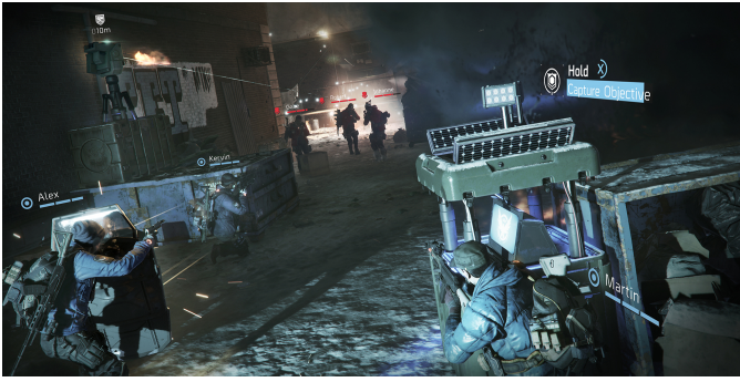
Fig. 1. An example of the gameplay of Tom Clancy's The Division (Ubisoft, 2016). Image taken from: store.steampowered.com/app/365590 . No copyright infringement intended.