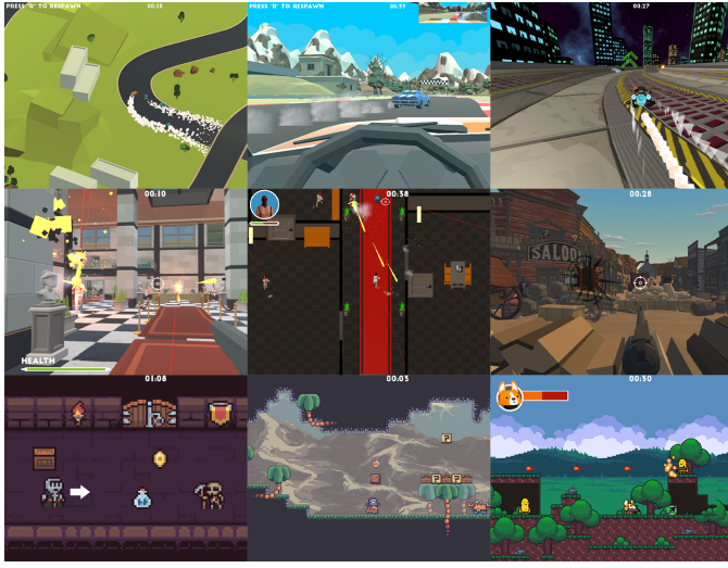
Fig. 2. The 9 games of the AGAIN dataset, one genre per row. Top row is racing games, mid row is shooter games and bottom row is platformer games.