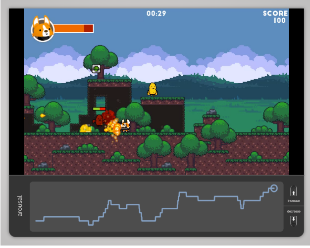
Fig. 3. Continuous, unbounded arousal annotation with the RankTrace method through PAGAN [7]. The figure shows the Run'N'Gun platformer game.

AGAIN offers continuous, unbounded arousal annotations of each gameplay session recorded with the PAGAN annotation tool [30] (see Figure 3). The interface shows the full history of the annotation process and does not limit the value range of the affect label. Due to these properties, the collected annotation trace preserves the subjective and ordinal nature of the player experience [8] and makes the dataset optimal for modelling through preference learning (see Section IV-A).