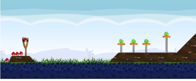
Fig. 2. Level 1-2 of the ‘Poached Eggs’ level series

learned in the development of such agents are essential in the development of future AI systems as well [1].