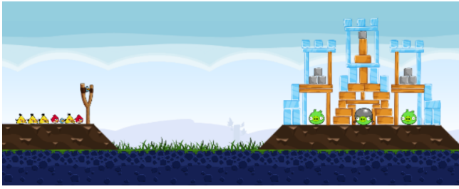
Fig. 1. An image of an Angry Birds level

along with qualitative reasoning rules for shots in Angry Birds. We also develop and test a set of heuristics that determines what shots may be considered sub-optimal.