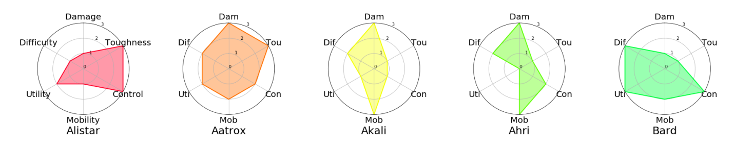
Fig. 1. Example of radar plots for five different champions (i.e., Alistar, Aatrox, Akali, Ahri, Bard), each defined by six attributes (we use the first three letters as abbreviations of attribute names). We observe that every champion has its weaknesses and strengths regarding the six attributes and no champion is designed to be perfect [20], so that champions in a team need to cooperate to win.