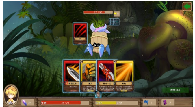
Fig. 2. Screenshots of Dream Cage , the card game that we developed and used to conduct our experiment. The picture is the battle screen, where players face opponents and must deplete the opponent's health bar by selecting which card(s) to play next. In the screenshot, the player lost four health points.

and we used questionnaires to evaluate the game experience in each condition.