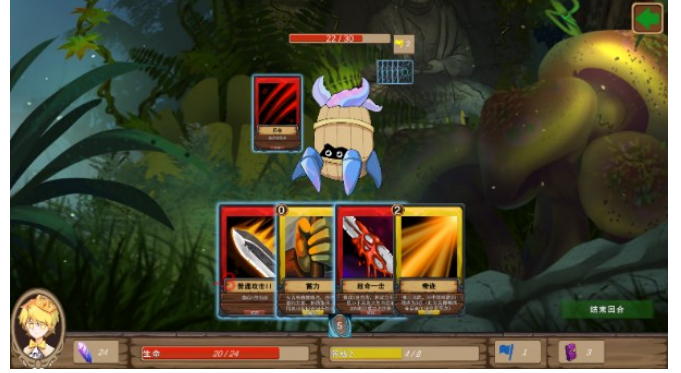
Fig. 2. Screenshots of Dream Cage , the card game that we developed and used to conduct our experiment. The picture is the battle screen, where players face opponents and must deplete the opponent's health bar by selecting which card(s) to play next. In the screenshot, the player lost four health points.

and we used questionnaires to evaluate the game experience in each condition.