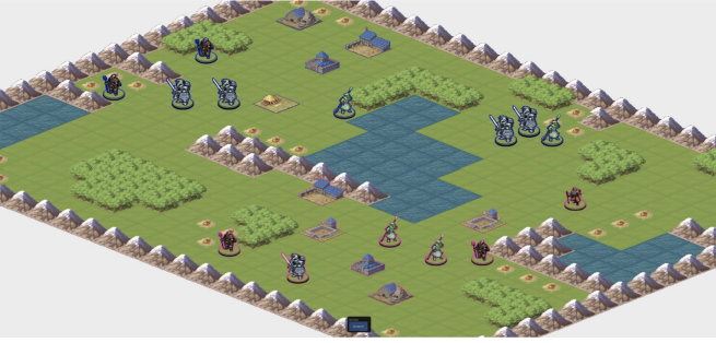
Fig. 1. A classic scene of Stratega framework.