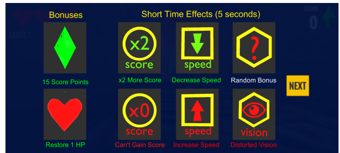
Fig. 2. MAK game bonuses shown in tutorial.