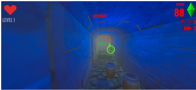
Fig. 1. MAK game process.

flexible data collection from participants. The game consists of two major parts - visual interactive gameplay and adaptive soundtrack. The genre of game is an endless running platformer , much like Subway Surfers [23]. While running in a mobile game, Subway Surfers , the player can swipe up, down, left, or right to avoid crashing into oncoming obstacles, especially moving trains, poles, tunnel walls and barriers. Also, the player can catch coins to increase the score. This game genre does not require much time for understanding the concept, which should allow players to focus on understanding dependencies between game and music.